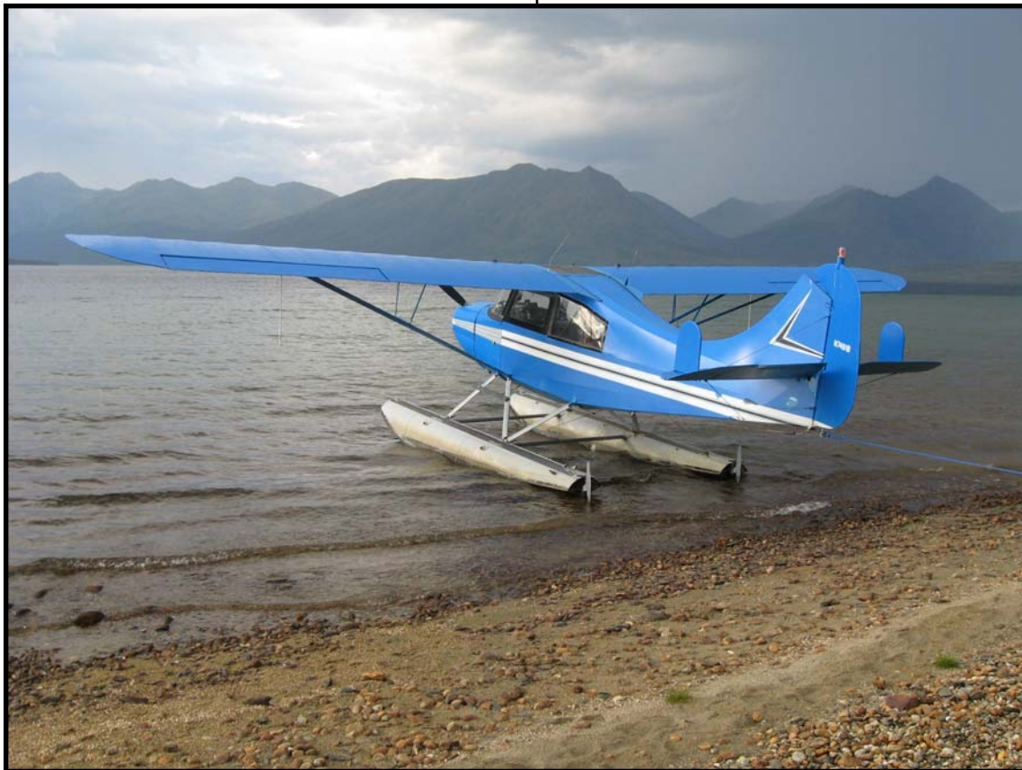
Champ N7481 Bravo heeled in at Walker Lake last summer